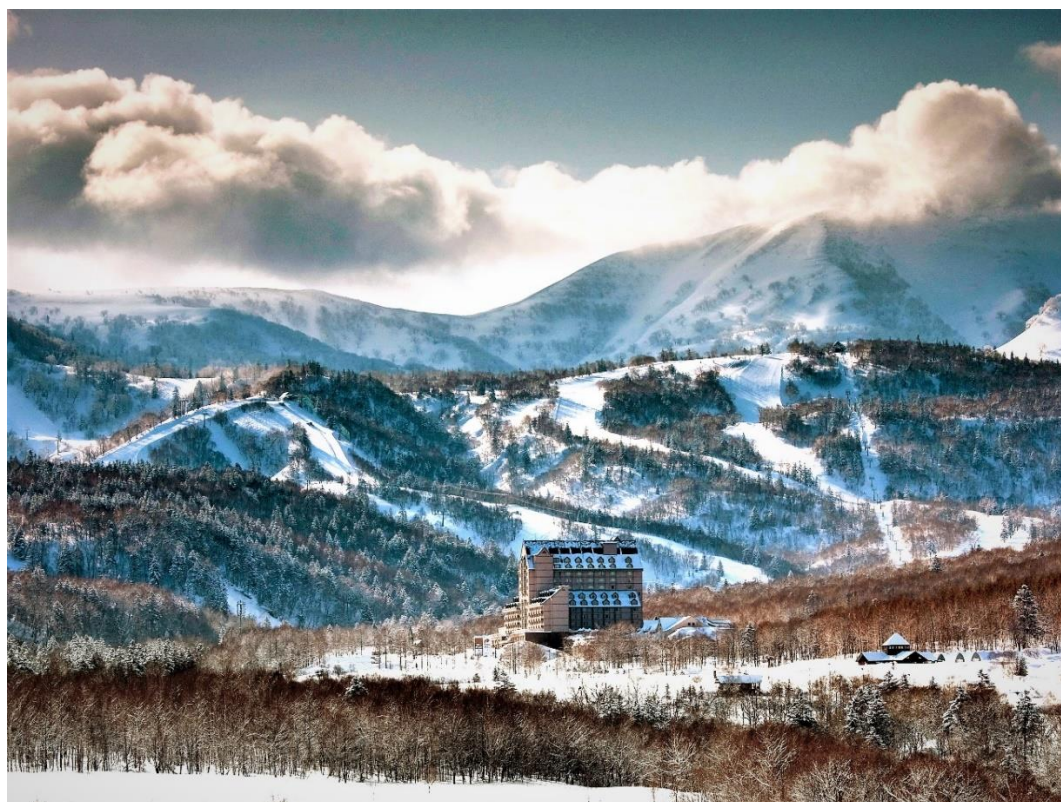
Kiroro Resort, panoramic view looking towards The Kiroro, a Tribute Portfolio Hotel – Iconic Hokkaido